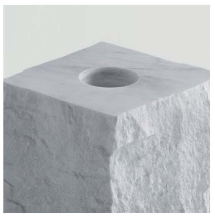
A minimal expression referencing the traditional way in which solid stone is quarried, the Artemis series of offset candle holders cast non-regular rays of delicate light — aiding ambience at any experiential moment.