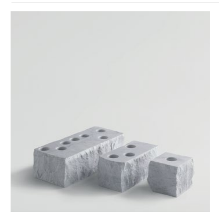
Raw edges evoke a feeling as if someone has literally hacked into the natural formation of the stone and created the piece themselves.